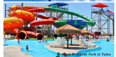
West Wetlands Park in Yuma