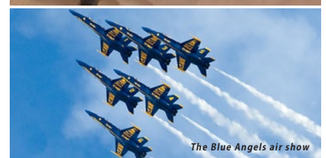
The Blue Angels air show